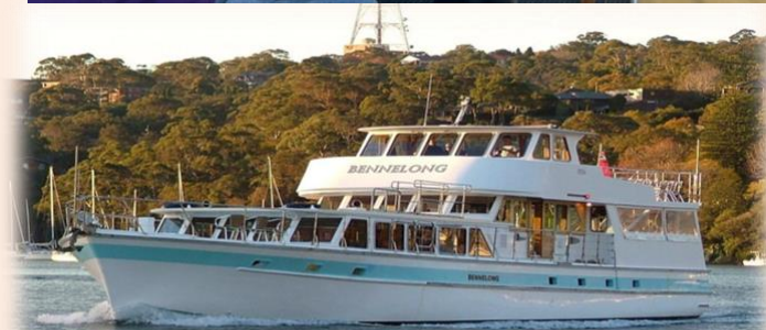
MV BENNELONG - Caprice Charter