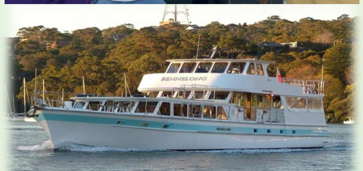
MV BENNELONG - Caprice Charter